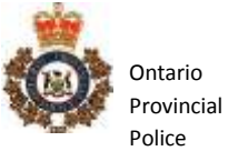
EXHIBIT 1 Release and Discharge Relating to Consent to Disclosure of Criminal Record Information

Surname Given name Middle name(s) Date of Birth (dd/mm/yy) Male Female